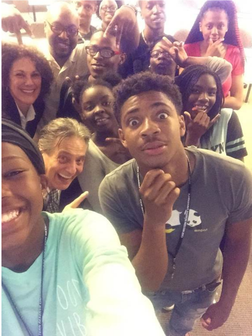
The post CWRU Upward Bound Graduation Party!