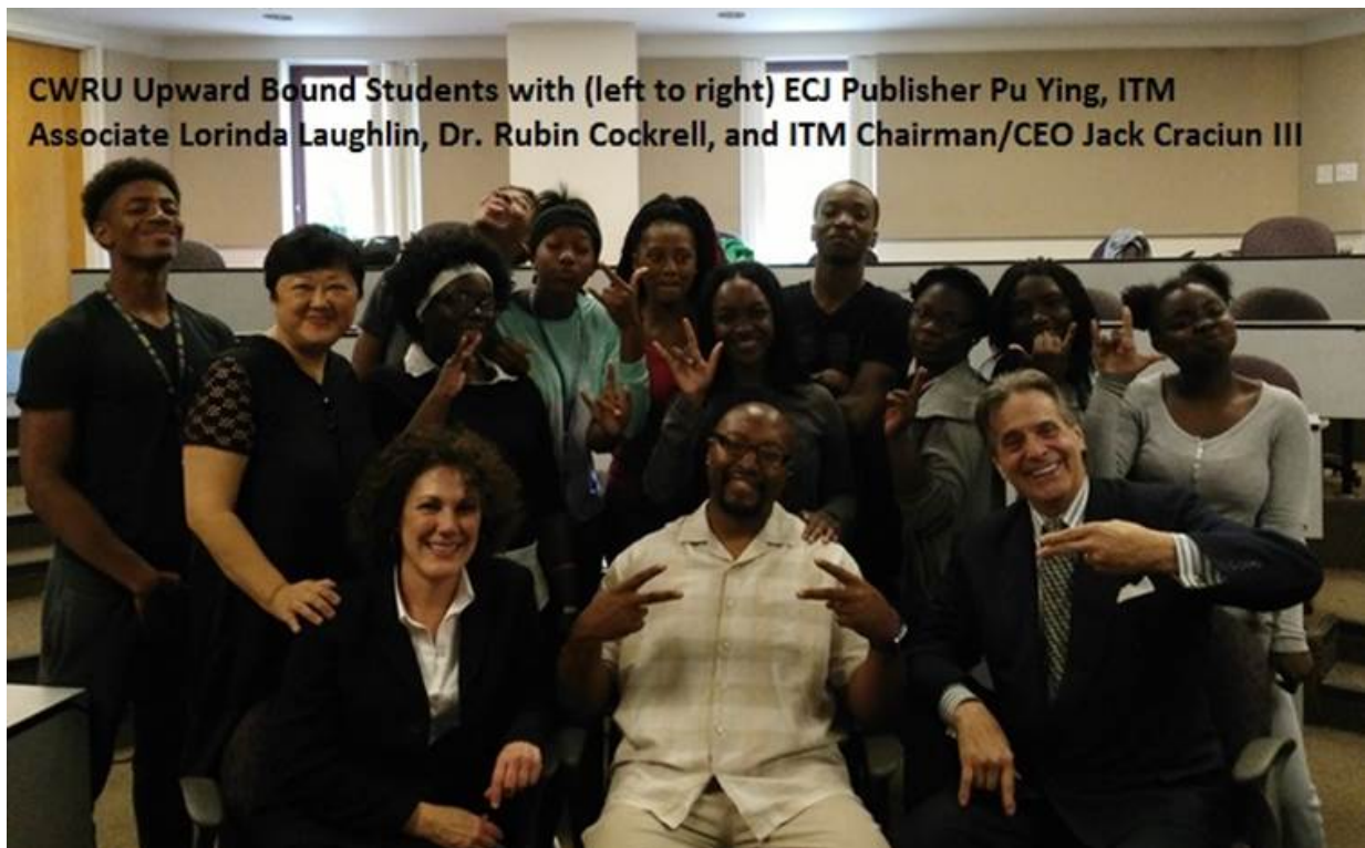
Members of the CWRU Upward Bound

Joined Case Western Reserve University Upward Bound Leadership Program Invited to the Board of Trustees of Cleveland’s Esteemed Benedictine High School